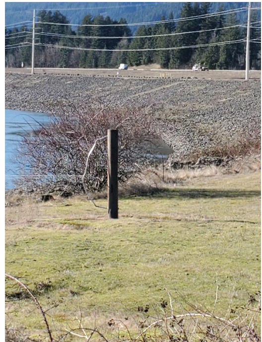
Figure 2. Bent PH2 Avian Deterrence Wire Array Anchor