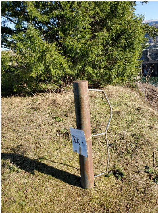
Figure 1. Bent Spillway Avian Deterrence Wire Array Anchor

Bonneville Dam uses a total of four avian wire arrays for passive avian deterrence throughout the fish passage season. These arrays are located at: Powerhouse 1 (PH1) Tailrace, Spillway Tailrace, Powerhouse 2 (PH2) Tailrace, and at the outfall of the PH2 Corner Collector (B2CC). These avian wire arrays each fan out from an anchor point located on shore. The PH1, PH2 and Spillway avian arrays have been discovered with bent portions of each of their anchoring system (See Figures 1 and 2). Bonneville Project Engineers have determined these 3 anchors pose a significant safety concern with the potential to severely injure personnel or visitors, as well as cause property damage in the vicinity of these high-tension stainless-steel lines if the anchors were to fail. USDA APHIS will remove the current avian wires, modify the anchors to remove any safety hazards, and will restring each avian array.